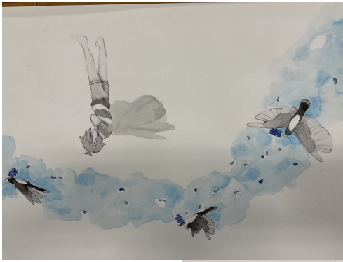
Laura Kerr - 'Sorrow's Wings' water colour on paper