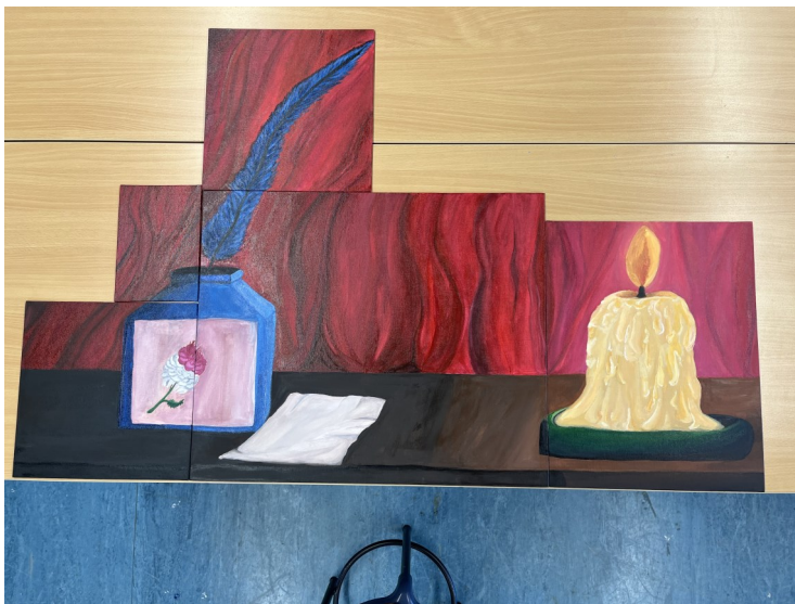
Taylah Boatwood - 'Nothing Gold can Stay' Gouache on board