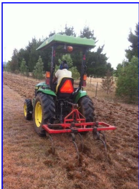
Ni-Ollien Malae ploughing in readiness for pasture renovations