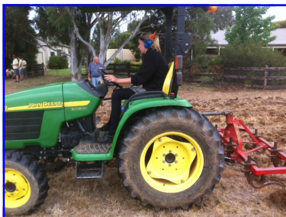
Yr 11 Ag preparing ground for pasture renovations