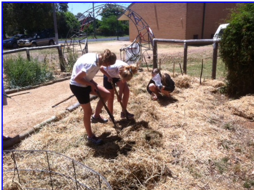
Agriculture students assisting with maintenance and planting at the Community Gardens.